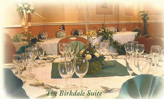
The Birkdale Suite

You will be guided by our team every step of the way, whilst allowing you to be in control of your wedding plans. Our enchanting banquet rooms can be transformed from a formal Wedding Breakfast layout to an informal party atmosphere for your Evening Reception.